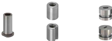
Retaining Threaded Bushings 1852