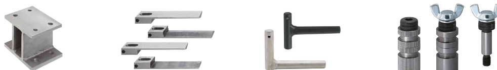
Angle Plate Support Stands 1858