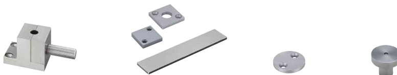
Clip Detaching Blocks for Plastic Panels 1853