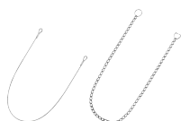
Wires for Slot Pins, Chains for Slot Pins 1862