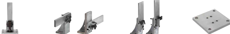
Hinge Units for Fixtures - Vertical 1856